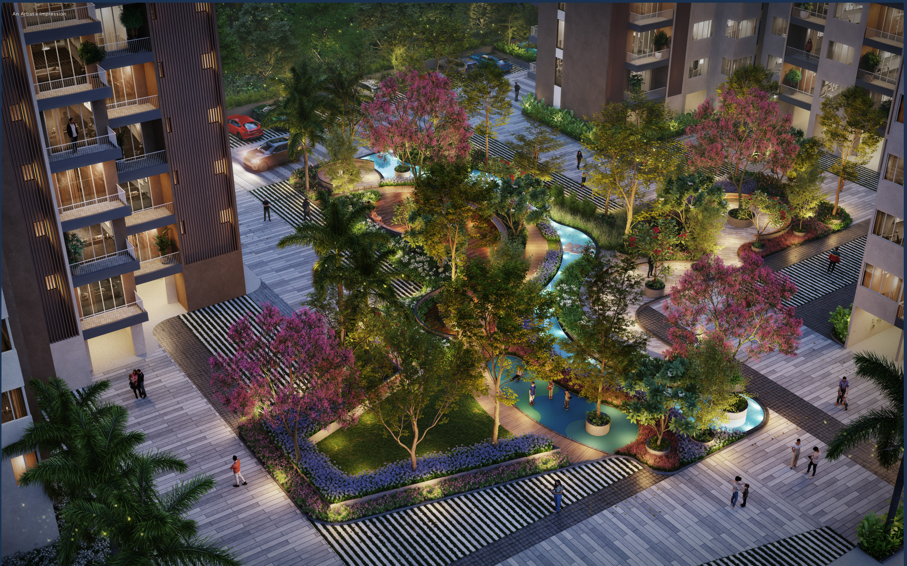
View of The Central Lagoon & Park